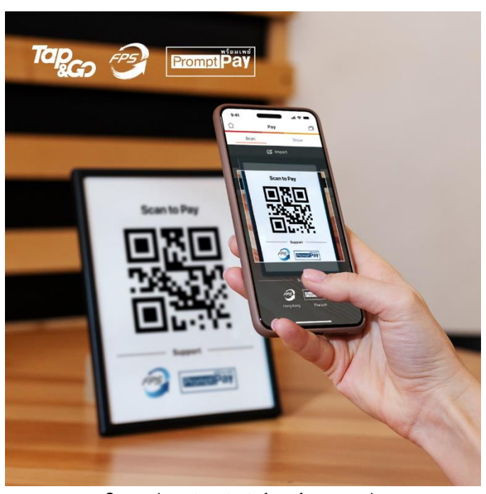
Screen layout contents for reference only

From now until 31 January 2024, customers of 1010 and csl as well as eligible Tap & Go users<sup>7</sup> can redeem one Thailand data roaming pass<sup>8,9,10</sup> for free at 1010 Centres or csl shops. The data roaming pass provides 24 hours of roaming data, which customers can enjoy upon arrival by simply switching on their mobile phones without swapping SIM cards for greater convenience.